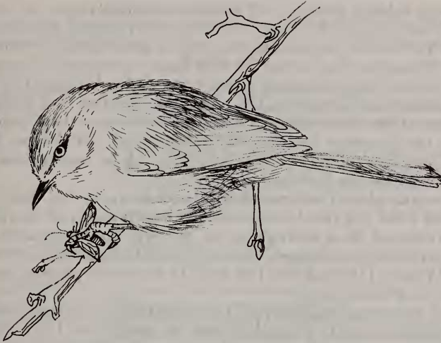
Figure 2. Severtzov's Tit Warbler Leptopoeile sophiae manipulating a moth by use of the foot.